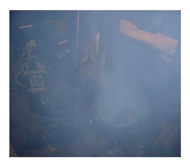
Figure 2: Poor biomass combustion in a kitchen in Makindye Division, a source of indoor air pollution