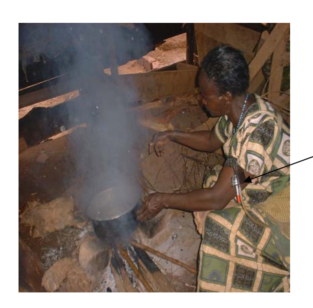
Figure 1: Personal sample head for measuring respirable particulate matter from the combustion of biomass in Makindye Division. Three stone fire stove being used