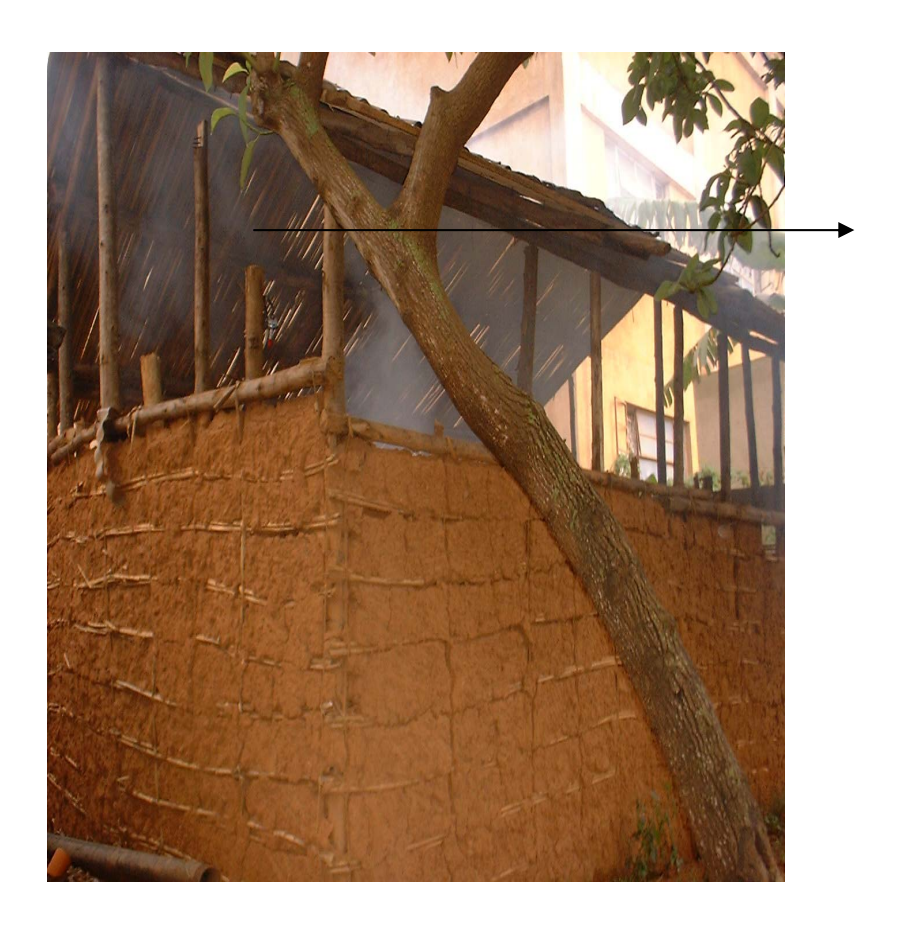
Figure 4: Kitchen where cooking is taking place. Exposure to pollutants is minimised due to ventilation allowed by the kitchen layout.