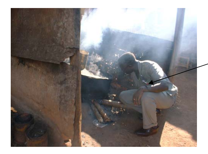
Figure 5: Boiling water for mixing in local brew. The arrow show a sampler attached to the collar for trapping particulate matter