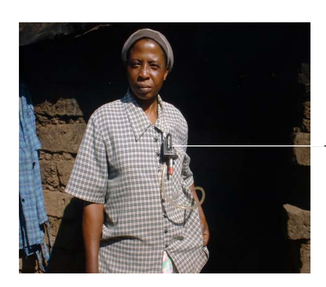
Figure 7: Sampler for trapping particulate matter. The lady was busy boiling water for mixing in local brew in Banda