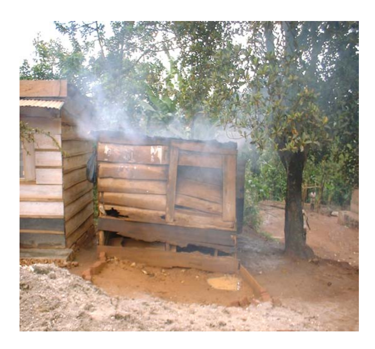
Figure 6: A kitchen with poor ventilation and poor air circulation. There is a likelihood of indoor exposure to smoke.