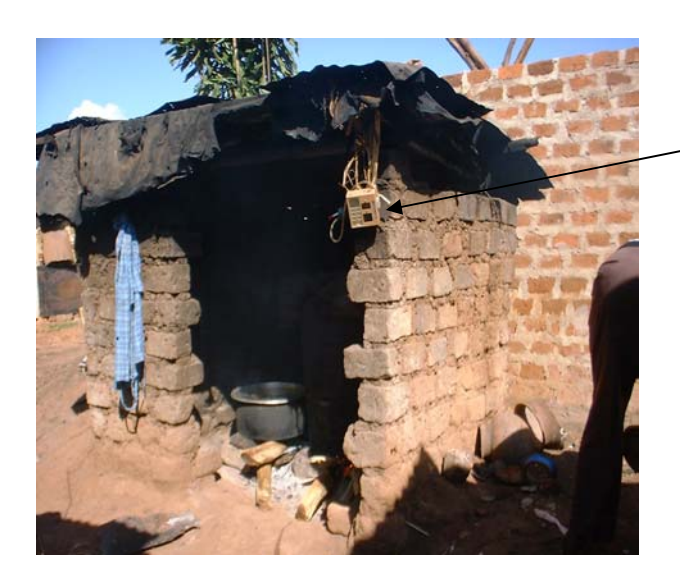
Figure 10: Sampler for trapping total particulate matter from the combustion of biomass from this structure used for boiling water to mix with local brew in Banda