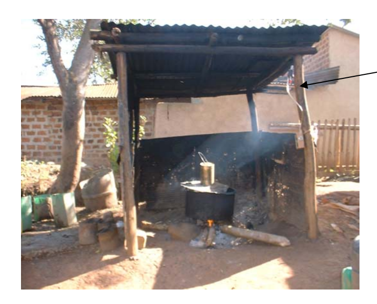
Figure 9: Personal sampler for trapping total particulate matter from the combustion of biomass. This structure is used to boil water for mixing in local brew